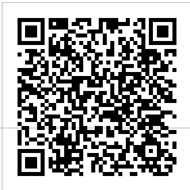
Gasket Sizing Key